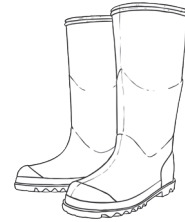
wellies or strong boots/shoes